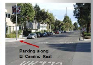
25 Spaces in Front of Elks Lodge

Plus 50 Spaces at Crowne Plaza (if available)