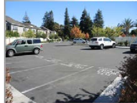
60 Spaces Behind the Elks Lodge