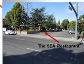
70 Spaces Next to the Elks Lodge