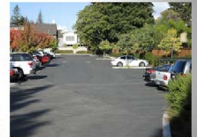
60 Spaces Right of the Elks Lodge