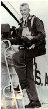
THERE IS A RESEMBLANCE!