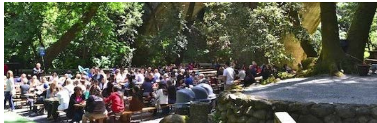
GREAT FOOD, DRINKS AND GAMES

DON'T MISS THE PICNIC!! SEND IN THE REGISTRATION FORM TODAY!!